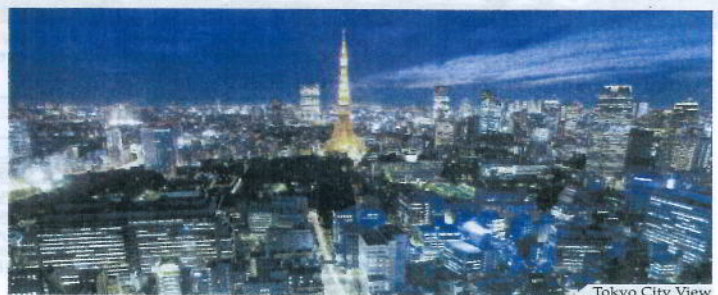
Tokyo City View