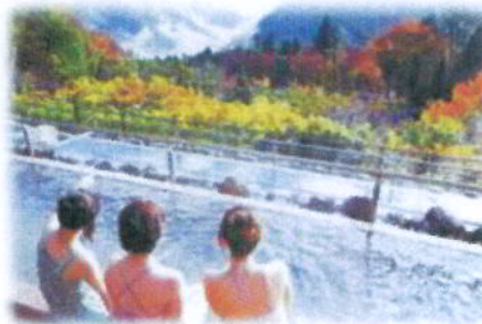
Optional Yunessien (hot spring theme park)